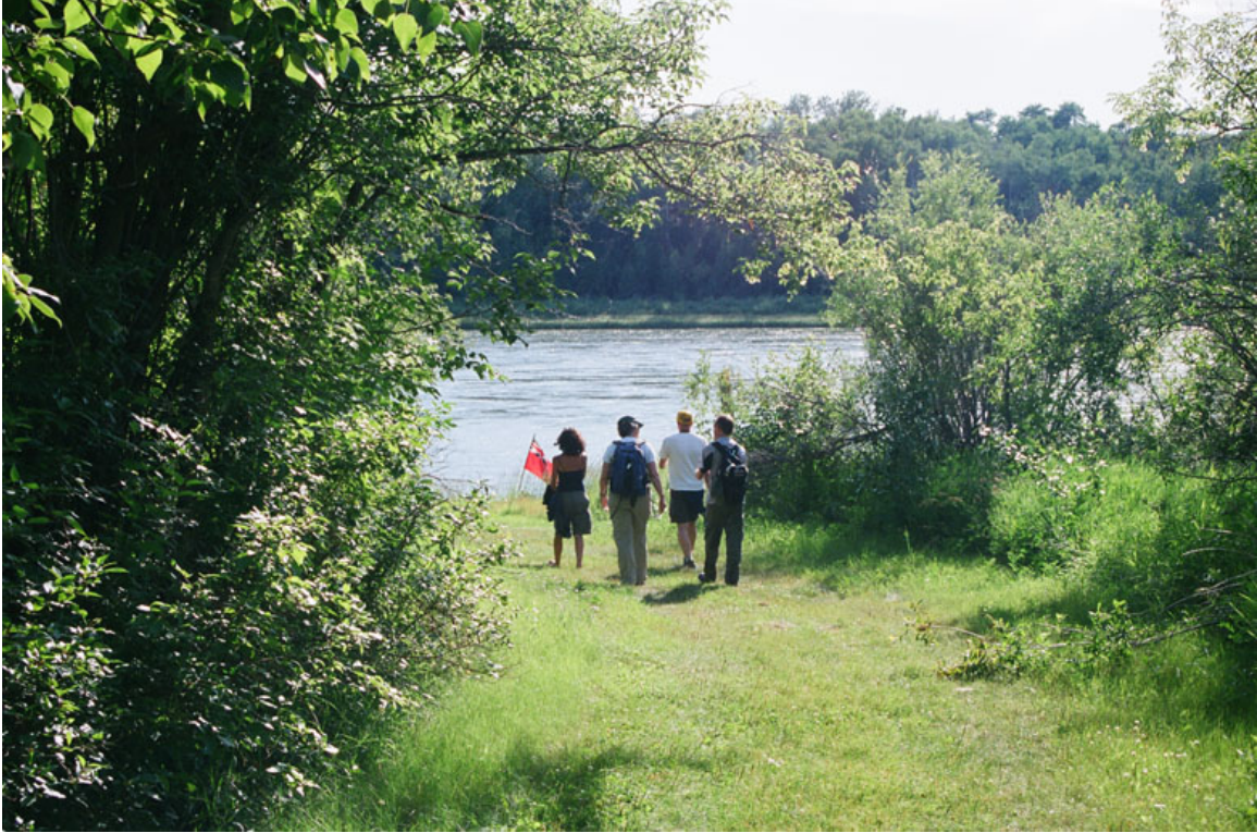
Canoeists hiking back to the junction of the Carlton Trail and the South Saskatchewan River after visiting Batoche National Historic Site.